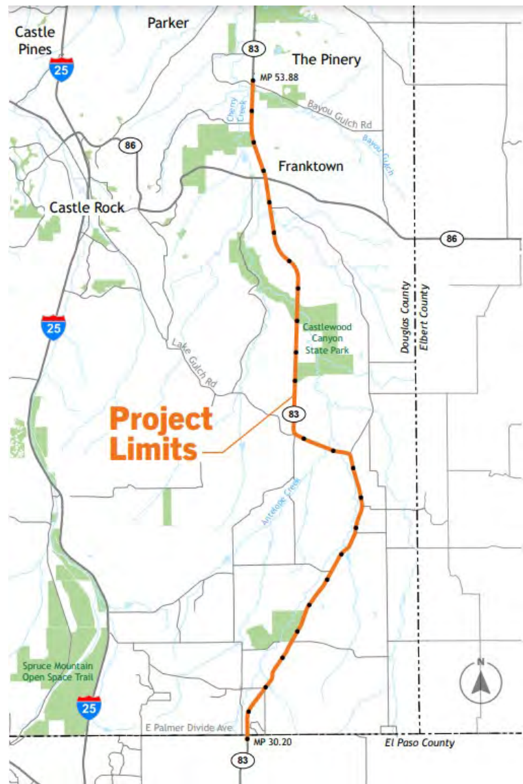
Figure 1 Project Location Map

SH 83 is a corridor that connects the southeast Denver Metro communities to the northern communities of Colorado Springs. Our project limits are such that SH 83, on the northern end at Bayou Gulch Road, is also known as Parker Road, and goes south through Franktown and Douglas County, ending at the southern limit of East Palmer Divide Avenue, also known as the County line that divides Douglas with El Paso County. See Figure 1 for the project limits. Note that State Highway (SH) is interchangeable with CO 83; for the purposes of this report, SH 83 is used.