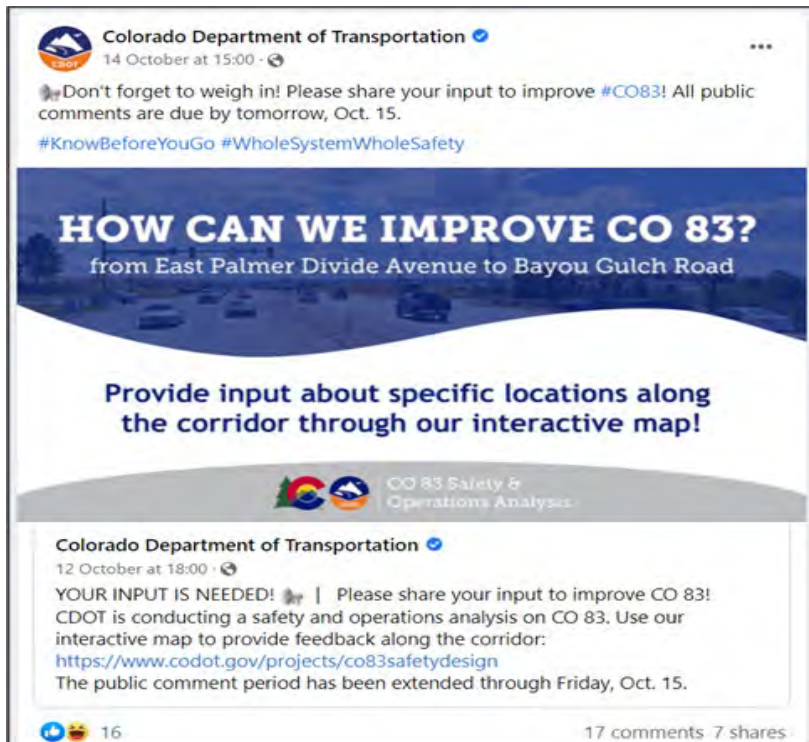
Figure 4 Facebook Post 2 – October 14, 2021