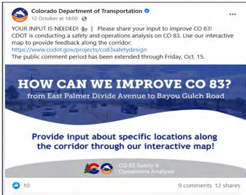
Figure 3 Facebook Post 1 – October 12, 2021

Most comments were not about this specific project – many provided feedback about COTRIP’s recent update at that time. A couple of overall suggestions for SH 83 were given, including the addition of a toll lane and bike facilities.