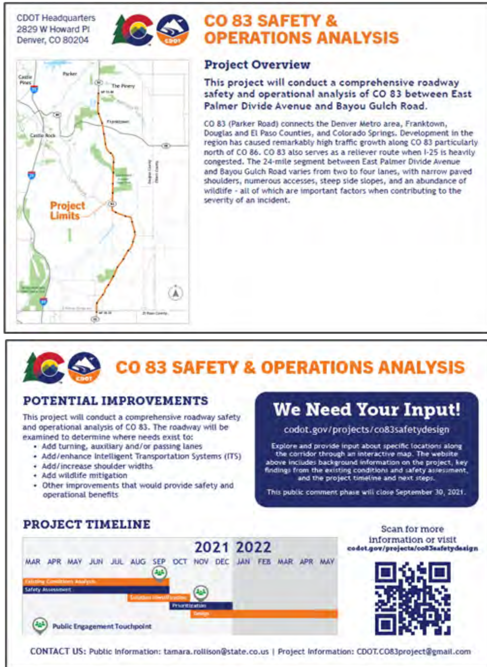
Figure 2 Postcard Mailer (Front and Back)

Starting on September 10, 2021, a total of 8,092 mailers were sent to residents and businesses near the SH 83 corridor (16 U.S. Postal Service mailing routes). The mailer included a QR code linking to the project webpage and input map, which was scanned 146 times between September 17 and October 22, 2021, 80% of which were from iOS devices. The postcard mailer front and back are shown in Figure 2 below.