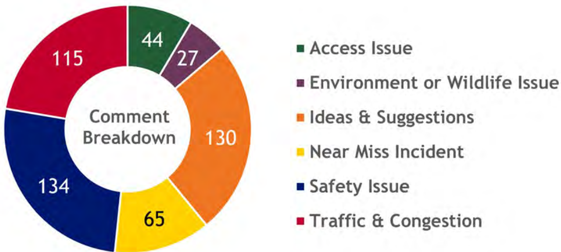
Figure 5 Interactive Public Input Map Comment Category Breakdown

The full topics captured by the public comments can be shown below in Figure 5 highlighting that the main comments were on captured on safety.